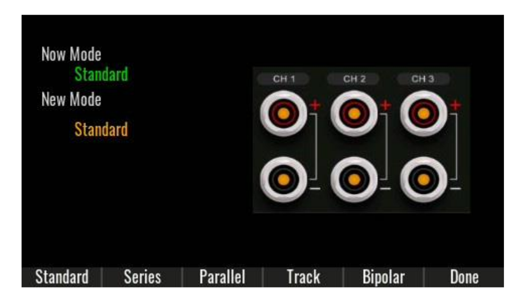
The menu bar below selects different built-in output modes

The IT-N6300 Series Triple-Channel Programmable DC Power Supply integrates multiple intelligent features, enabling engineers to complete testing tasks more efficiently: