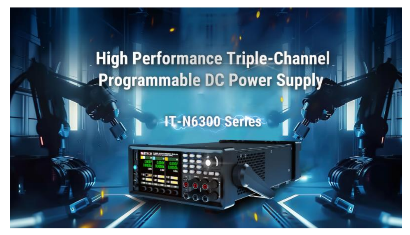
Breaking Tradition: Overcoming the Technical Bottleneck of Negative Voltage Power Supply

In cutting-edge applications such as new energy, semiconductors, automotive electronics, and lasers, testing requirements are becoming increasingly complex. Traditional positive voltage power supply solutions can no longer meet the demands of chip bias testing, electrochemical deposition processes, operational amplifier power supply, and other applications requiring negative voltage and seamless positive-negative voltage switching. ITECH IT-N6300 Series triple-channel programmable DC power supply revolutionizes negative voltage power solutions with its built-in bipolar output mode. Without additional wiring, it enables efficient and stable negative voltage supply, significantly enhancing testing convenience, stability, and precision.